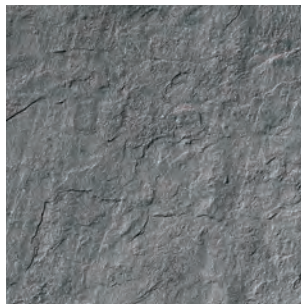
Vulcan AD 05 NAT*