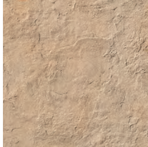
Island AD 02 NAT*