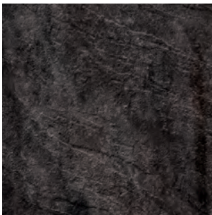
Black Reef AD 04 NAT