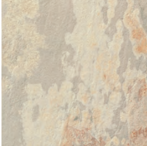
Shore AD 01 NAT